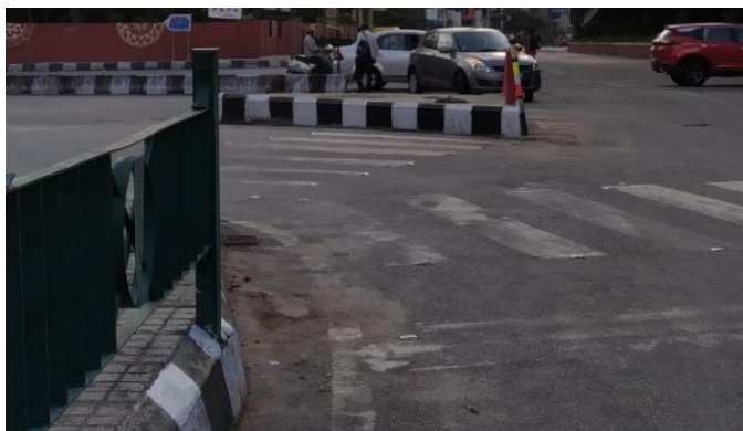
No Turning Markings at junctions